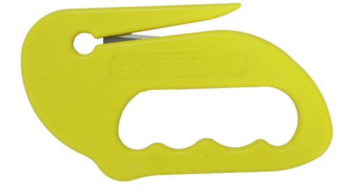
100 SCBC EZ-ON Safe Cut Belt Cutter